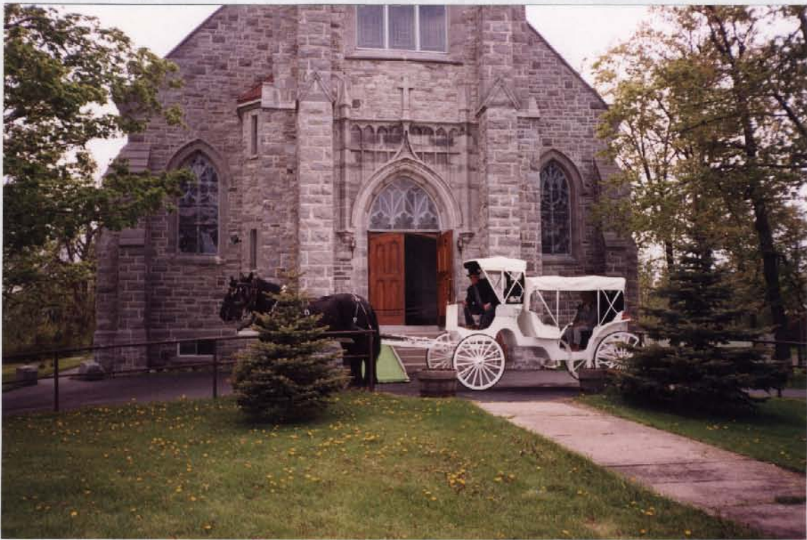
WHITE VIS-A-VIS - GREEN INTERIOR.