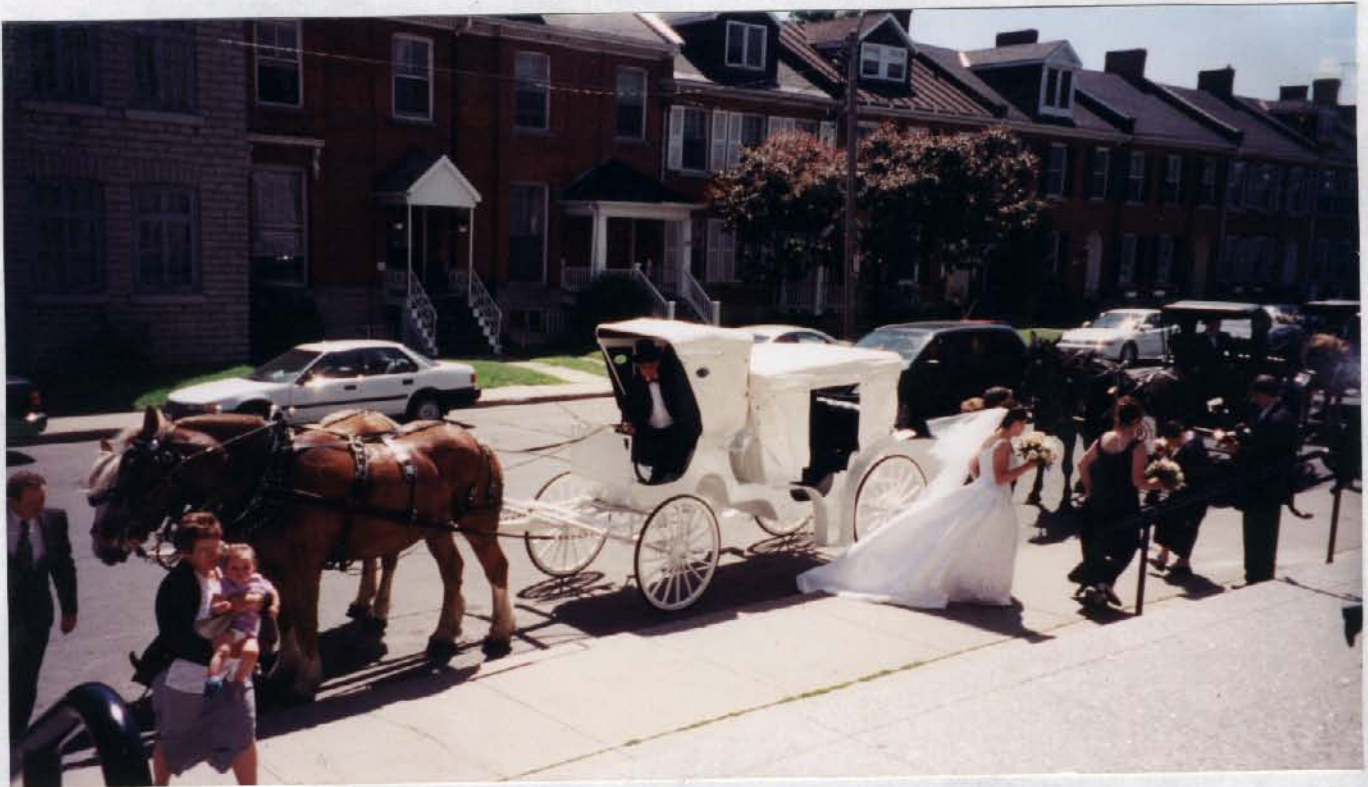
ARRIVE IN ELEGANT STYLE