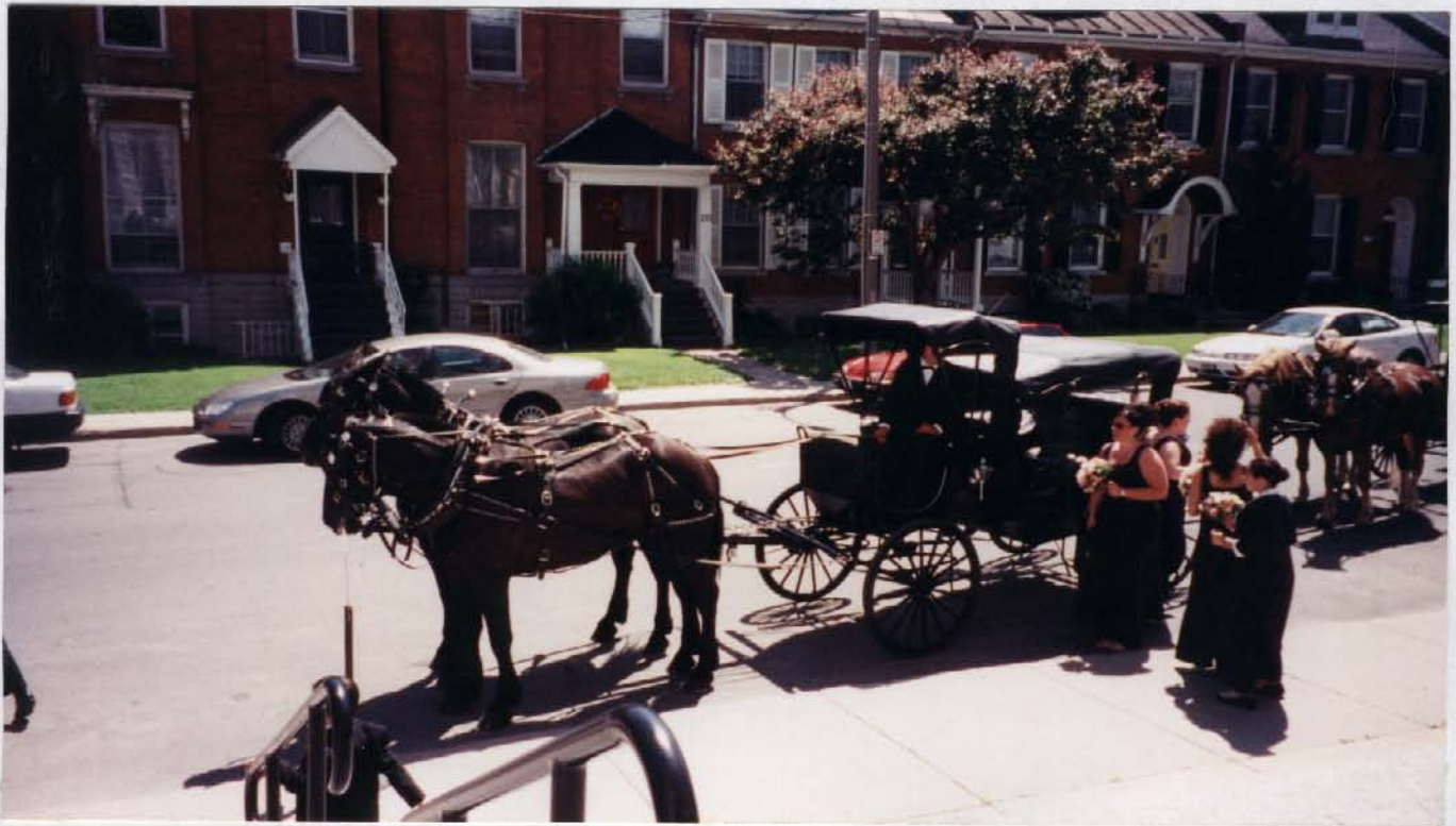
BLACK VIS-A-VIS - ROYAL BLUE INTERIOR.